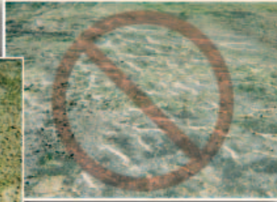
70/30 WOOD/PAPER + 3" RAIN